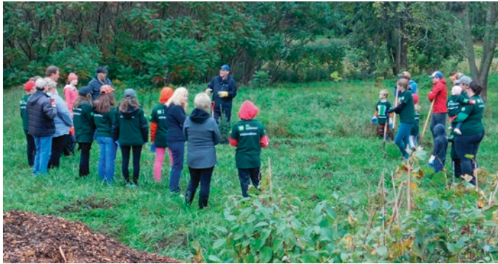
Photos from some of this year's TD Tree Day events in London (Hickory Woods, Meander Creek Park and Greenway Park, at left) and Mitchell.