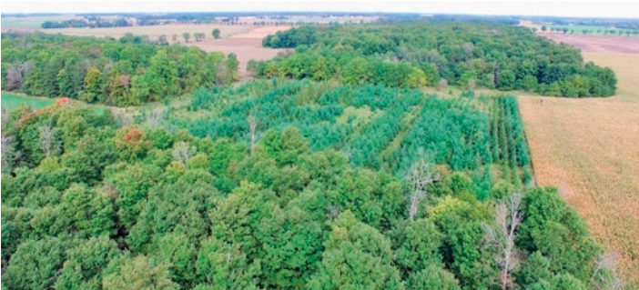
Drone photo looking north towards the 8 acre plot, planted in 2007.

Contact: Karen Pugh, Resource Specialist