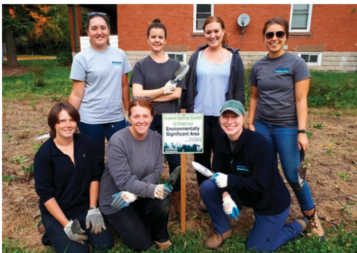
These UTRCA staff planted 800 wildflower plugs in October.

Contact: Karen Pugh, Resource Specialist